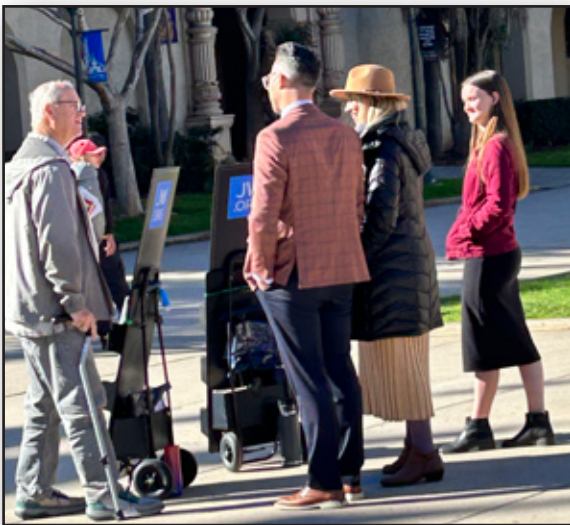
I always attempt to speak with JW's even though often I have tried before. The man on the right is a JW since his youth. I encouraged him to read the Bible without Watchtower helps. I told him JW's in the past were told that if they did they would go into apostate Christendom beliefs. He told me that was false. Later I brought and read to him the quote from the official online Watchtower library. When confronted he said it didn't matter, he was willing to trust the Watchtower anyway. Heart breaking.