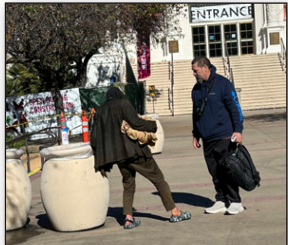
This is an interesting photo. The man on the right is a Catholic. His wife told him to give this homeless man his shoes which were in his backpack. The homeless man was barefoot. I spoke to the Catholic man shortly after and commended him for his kindness. Then I told him of the greatest kindness of Jesus and His sacrifice.