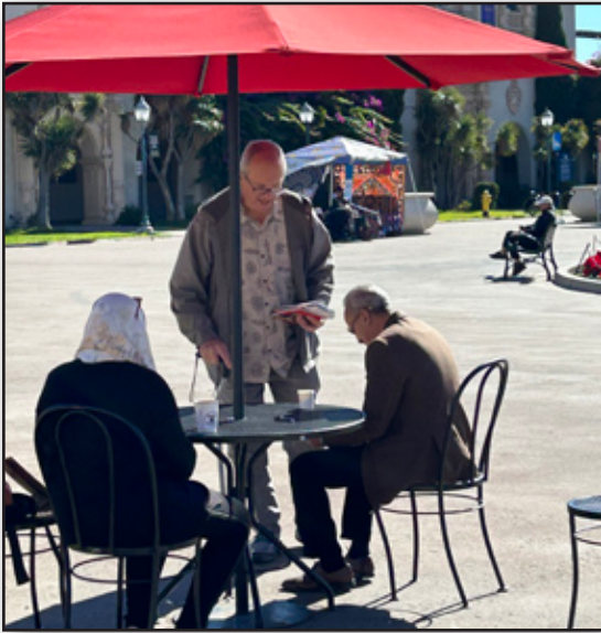
This is a Muslim couple at Balboa Park. He's actually reading through our tract "Jesus and the Quran". I was surprised that he was somewhat indifferent and didn't want to talk further. Who knows what he read may have an impact.